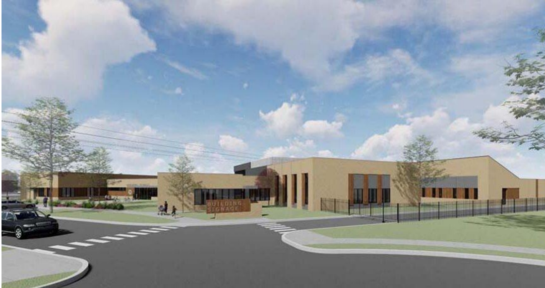
Rendering: BWBR Architects Inc