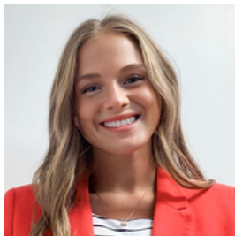
Riley Corrigan Architecture