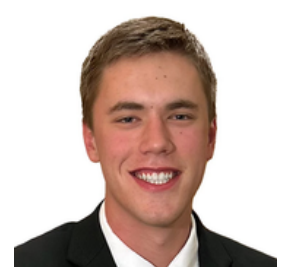
Hans Stelpflug Construction