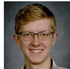
Owen Hill Electrical Construction Technology